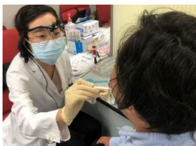
For Public health